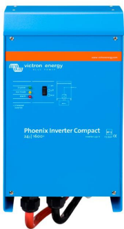
Phoenix Inverter Compact 24/1600

The possibilities of paralleled high power inverters are truly amazing. For ideas, examples and battery capacity calculations please refer to our book "Energy Unlimited" (available free of charge from Victron Energy and downloadable from www.victronenergy.com ).