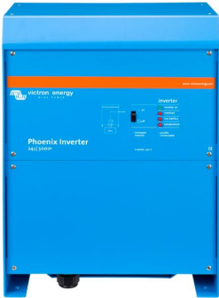
Phoenix Inverter 24/5000