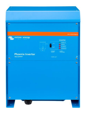
Phoenix Inverter 24/5000