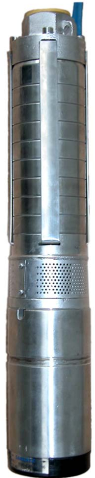
PS150-Centric C-SJ5-8 Controller, Pump and brushless motor