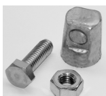
Universal Terminal (UT)