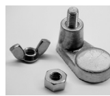
Wingnut Terminal (WNT)