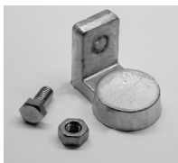
"L" Terminal (LT)