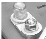
Embedded AP with Stud Terminal (EAPS)