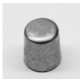
Automotive Post (AP)