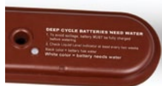
Water Indicator Signal