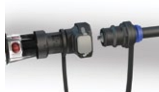
Coupler Connection with Water Flow Indicator