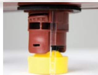
Independent Water Level Indicator

HydroLink™ watering system comes with a four-year, limited warranty.