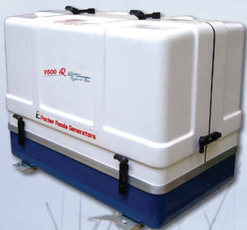
Panda 7500iQ Whisper HybridBox

At the Marine Equipment Trade Show (METS) in Amsterdam, The Netherlands, Fischer Panda introduced a new 'all in one' power supply solution: the Panda 7500iQ Whisper HybridBox. This compact unit combines a modern variable-speed generator with a shore power connection and efficient battery charging. Inside the HybridBox a Quattro 24/3000/70 is installed, which provides 230 Volt under the most adverse circumstances.